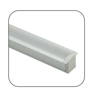
Alu Profile+End Cap