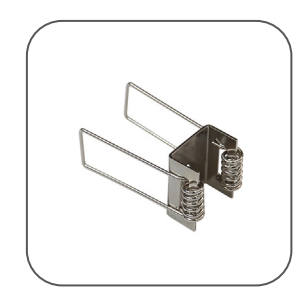
Mounting Clip (metal)