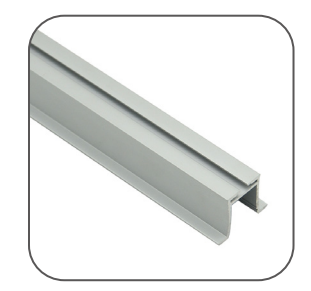
Alu Profile (back)